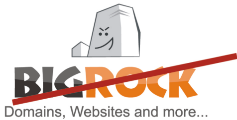
Rock Mascot Positioning